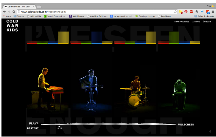
Fig. 3: "I've Seen Enough," 2009, dir. Sam Jones

The manipulation of the visual elements of a video may be, by far, the most common approach to an interactive music video, but it is not the only one. Predating even The Arcade Fire's iconic video, in 2009 California indie rockers Cold War Kids released an Internet-only video for their single, "I've Seen Enough" (dir. Sam Jones). The website features each of the four members of the band playing the song on their own separate track. By clicking on buttons over the musicians, the user can toggle through four instrumental options for each of them: for example, the drummer can be playing either a traditional drum set, a small logic board, a tambourine, or a pared-down drum kit. In this way, the user can mix her own version of the song. The visuals are spare, but the aural possibilities are plentiful.