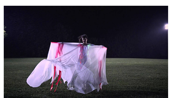
Fig. 4: Sprawl2, 2011, dir. Vincent Morisset

notable projects have experimented with other inputs. The Arcade Fire released a "dance activated" video, Sprawl2 (2011, dir. Vincent Morisset) for their single "Sprawl II (Mountains Beyond Mountains)", in which users could control the tempo of the dancers on the screen by waving their hands faster or slower in front of their webcam. In 2013, The Arcade Fire took this idea a step further by involving multiple devices. Their interactive video for "Reflektor," (dir. Vincent Morisset) their first single off their 2013 album of the same name, allowed the use of a smartphone to manipulate the images that appeared on the computer screen. Shot in Haiti, the video told the story of a "young woman who travels between her world and our own" ("Just a Reflektor"). After opening the website on their computer, viewers are asked to open a specific url on their smartphones, which then allows the computer to read the location of the smartphone in front of the computer's webcam. By moving the smartphone in physical space, the viewer can manipulate the images on the screen in different ways depending on the scene, and in some scenes the viewer themselves is projected into the video (via what the webcam is recording).