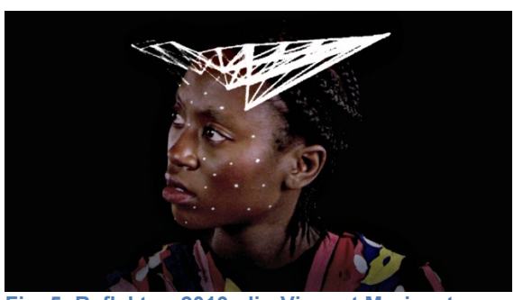
Fig. 5: Reflektor, 2013, dir. Vincent Morisset