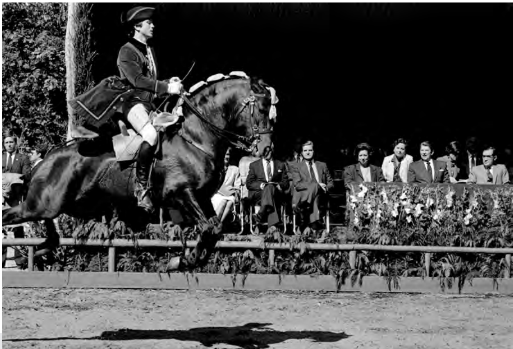
Visit of Ronald Reagan to Portugal