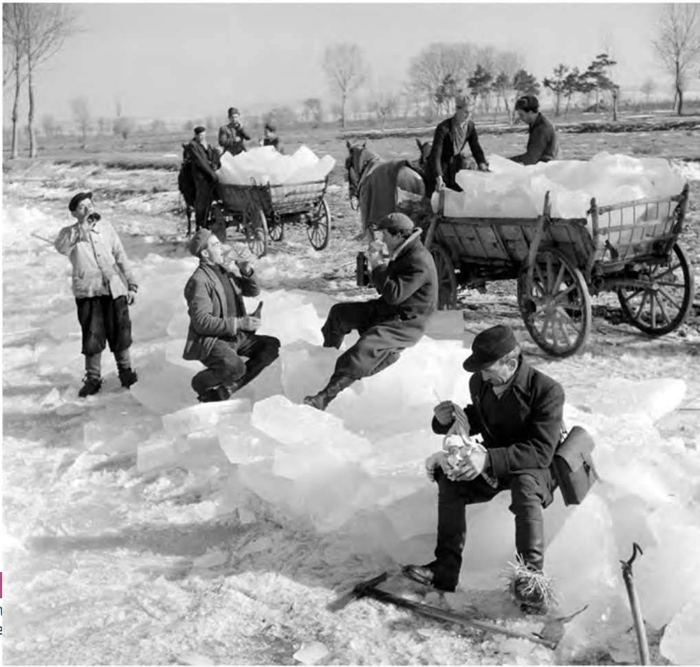
Collecting Ice on Lake Balaton, MTI, editorial use only, no sales.