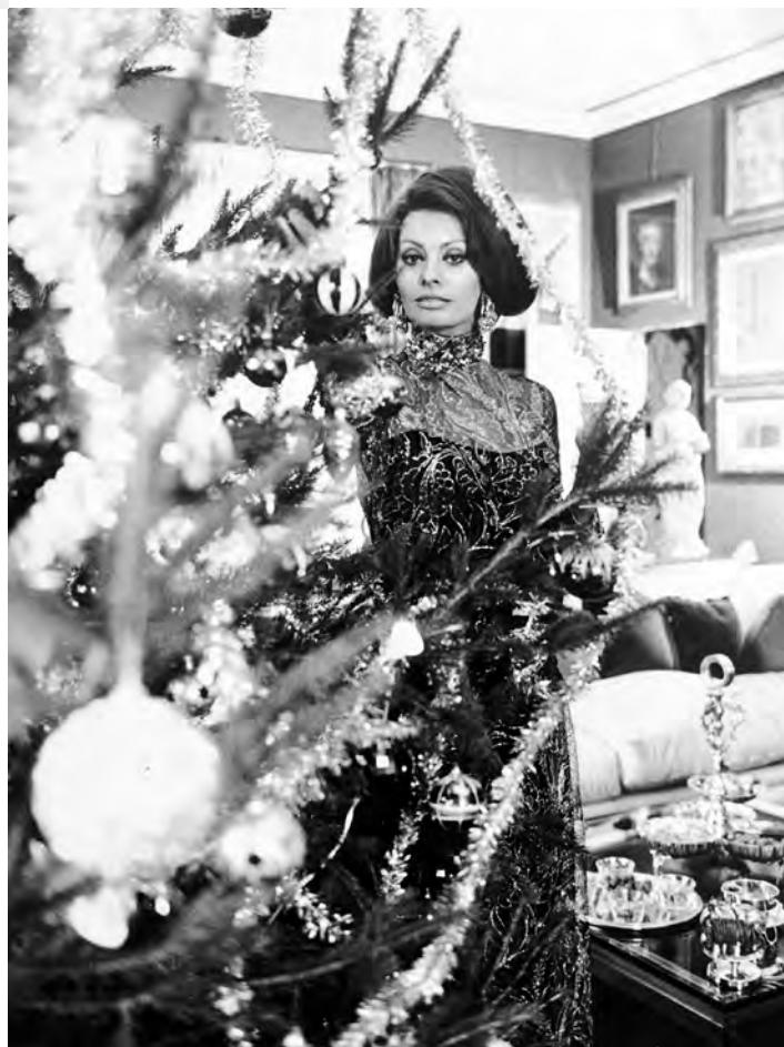
Sophia Loren Christmas, courtesy of ANSA, for editorial use only, no sales.