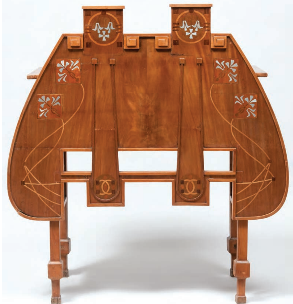
Costantino and Faustino Zatti, Desk, circa 1905, Wolfsoniana - Regional Foundation for Culture and the Performing Arts, Genoa

found in one of Carlo Bugatti's masterpieces, a cupboard from 1899. It is fashioned - in keeping with the artist's typical expressive freedom - using bizarre and unusual materials and techniques, which adorned the walnut frame with inlays in various types of wood and metal, embossed copper tondos, and fine parchment upholstery.