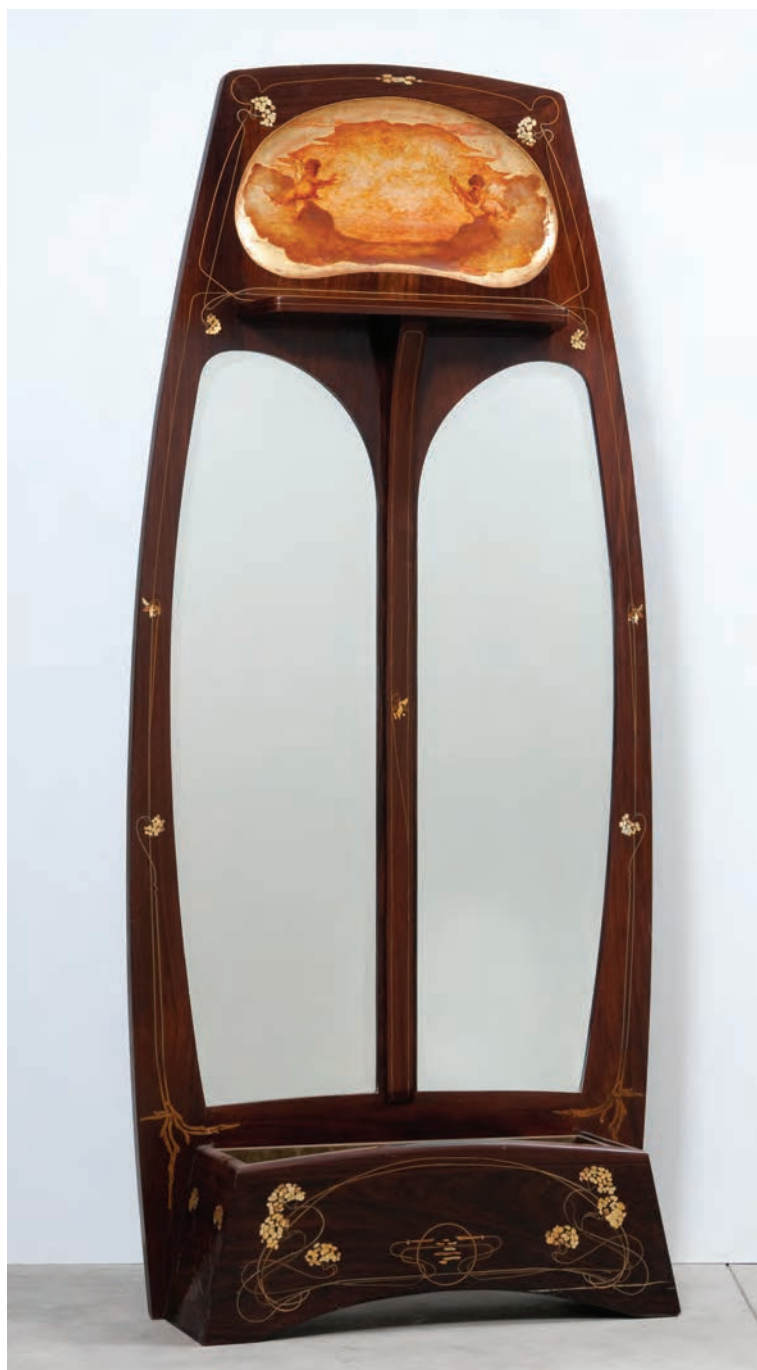
Carlo Zen, Flower box, circa 1902, Wolfsoniana - Regional Foundation for Culture and the Performing Arts, Genoa

The complexity of Art Nouveau and its expressive affinities with contemporary symbolist art, which through the emergence of cultural stirrings rooted in decadentism had marked the decline of the Verismo style typical of 19 th century realism, is evidenced once again in