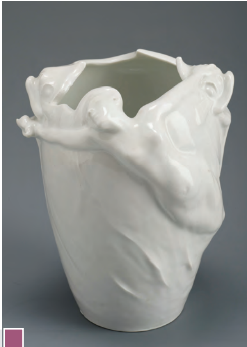
Vase Designer: Alf Wallander - Rörstrand Porcelain Factory, Linköping, 1896-97. Budapest, Museum of Applied Arts

In 1882 and 1884 he organized the Hungarian exhibition at the Union Centrale des Arts Décoratifs in Paris, and he developed a successful cooperation with Louis Delamarre-Didot, a member of the Board of the Union Centrale. Delamarre-Didot became the French representative of the museum, and started supplying the museum with exceptional works. The first significant purchase of modern works of arts was from the Paris World's Fair of 1889. Here Radisics selected significant French and British works, which were then purchased by Delamarre-Didot for the Museum. The collection included the works of Émile Gallé and Ernest Baptiste Lévêillé as well as Christopher Dresser. Many of these works exhibited technical novelties and their forms and decoration showed the way towards Art Nouveau. In fact, their makers were often those who later became the leading masters of Art Nouveau - such as