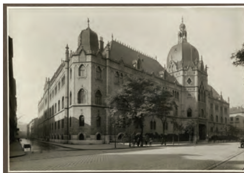
View of the Museum of Applied Arts around 1900

As the collection grew, it was soon decided that a new, permanent building needed to be erected for the museum, and as a result, an open architectural competition was announced in 1891. The winner was the team of Ödön Lechner and Gyula Pártos, whose groundbreaking design was then built in a short time, to be opened ceremonially in 1896. The new building, which was built for the museum as well as the School of Applied Arts, is generally regarded as the first major work of Art Nouveau in Hungary. Lechner, the architect, was looking to create a Hungarian architectural style, for which he looked for models in the East. The resulting building - which merges the masses of French renaissance architecture with motifs of Indian Mughal style and motifs from Hungarian folk art - is in a truly unique style. The modern, flat treatment of the facade, the great open spaces created inside, and the fluid lines of decorative details justify classifying the building as Art Nouveau. Moreover, the entire facade and the roof of the building are covered with ceramic tiles and ornaments created in the Zsolnay manufactory, a leading ceramics workshop of the time based in the southern Hungarian town of