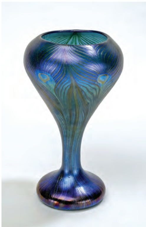
Peacock vase. Designer: Louis Comfort Tiffany: New York, c. 1898. Budapest, Museum of Applied Arts