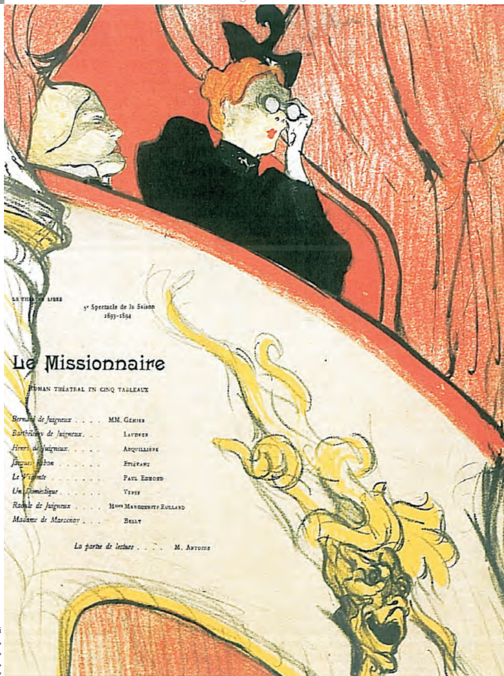
Henri Toulouse-Lautrec, 1864-1882, Le Missionnaire , drawing

Today everyone believes that the Internet is the solution for making us known to others and others known to us. Following this idea, in the Romanian libraries we have begun to develop a program for preserving the values of cultural heritage