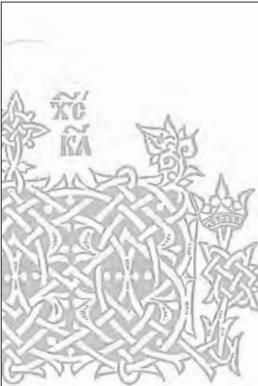
The Bishop Macarie, Title page of The Slavonic Missal , 1508, Targoviste, Wallachia