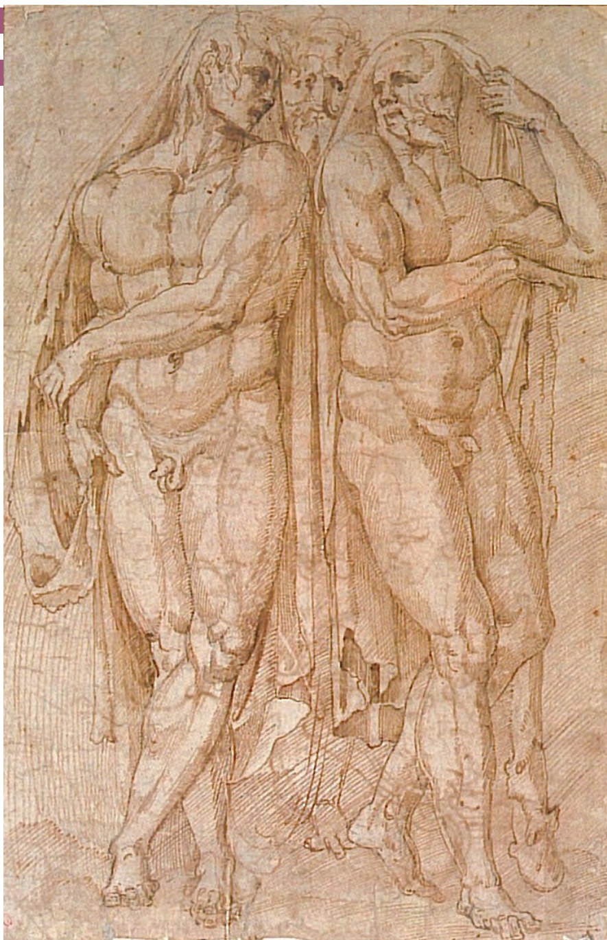
Baccio Bandinelli, 1493-1560, The three stages of human , drawing