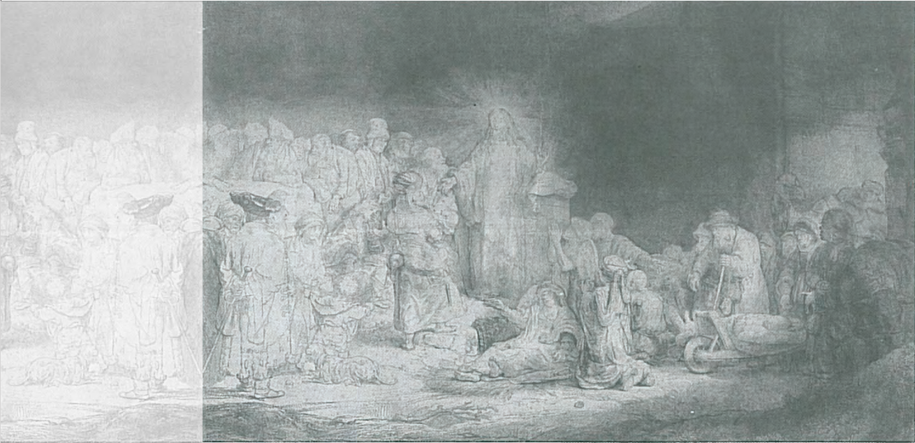
Rembrandt, 1606-1669, Jesus healing the sick , aqua fortis