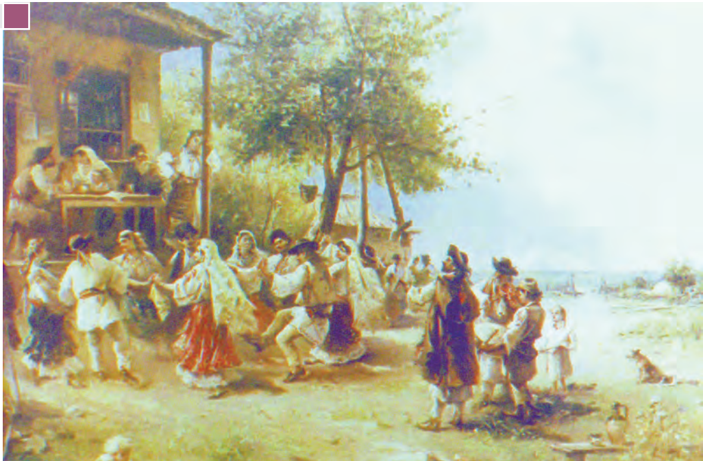
Theodor Aman, 1831-1891, Romanian painter, considered predecessor of Impressionism, Folk dance