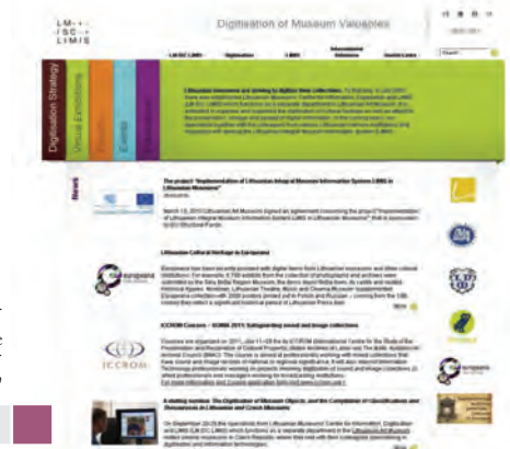
The front-page of LM IDC LIMIS Website "Digitisation of Museum Valuables"