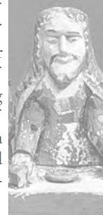
The Last Supper. Hipolitas Burneika. 1 st half of 20 th century. Polychrome wood; h 20 cm, l 40 cm, w 9.5 cm; Property of Lithuanian Art Museum. Inv. n° LM-1088

LIMIS is being created not only for computer-assisted stocktaking of museum collections and exhibits, but also their storage, management and control, which follows unanimous standards in accordance with the list of standards recommended by the Minister of Culture along with the well-established order on the preservation and stocktaking of museum collections. Another underlying objective is to integrate the databases of Lithuanian museums into a joint information system and to ensure the development and maintenance of the LIMIS electronic cata-