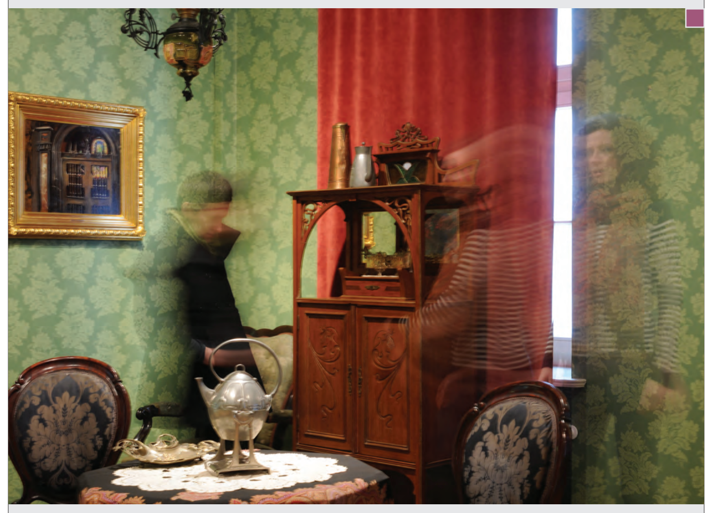
The Leon Wyczółkowski District Museum in Bydgoszcz.