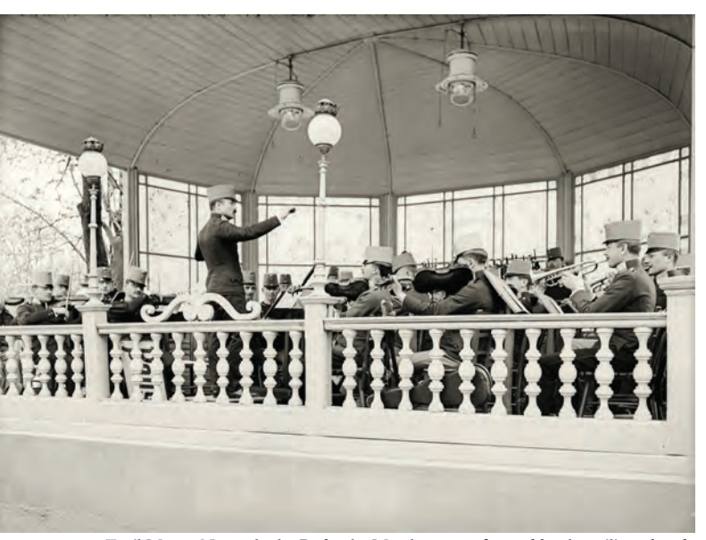
Not only the Radetzky March was performed by the military bands in the establishments of the Viennese Volksprater like the First, Second and Third Coffeehouse. Vienna. About 1905. Lantern slide.

remained largely unnoticed. Under the EuropeanaPhotography project, the highlights of the collection are now being restored and made accessible to the public.